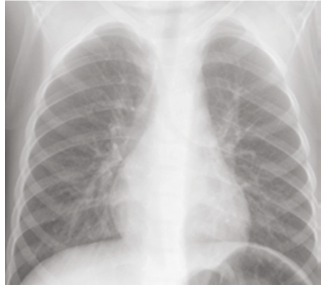
Figure 2: Chest radiograph showing interstitial infiltrates

Lung complications of pneumonia include empyema and, less commonly, pulmonary abscess and necrotising lung. Empyema is defined as intrapleural pus or a moderate to large exudative parapneumonic effusion which can progress to being loculated, with further development of a fibrinous peel [35]. The CXR cannot diagnose empyema, only the presence of parapneumonic fluid [36]. Loculated effusions may be difficult to distinguish from a peripheral lung abscess [36]. Lung abscesses manifest radiologically as cavities that may be isolated or occur within areas of consolidation [25]. Necrotising pneumonias initially appear as small lucencies within an area of consolidation, progressing to larger, fluid filled cavities [25]. The CXR will reveal the presence of larger cavities and abscesses, although minor changes may only be visible on CT [37]. In complicated pneumonia, CTs will reveal abnormalities